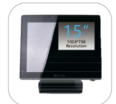
15 inch Bezel-Free True-Flat Projective Capacitive Touch Screen