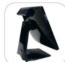
Customer Display VFD220