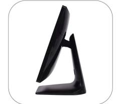
Cable Hidden Bracket