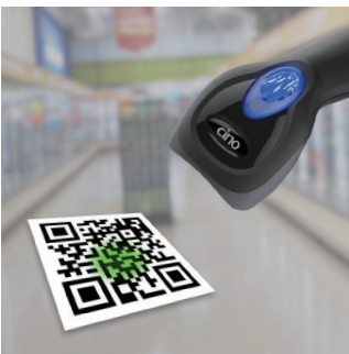
Sharp Green Aimer