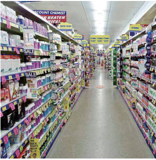
Retail & Commercial