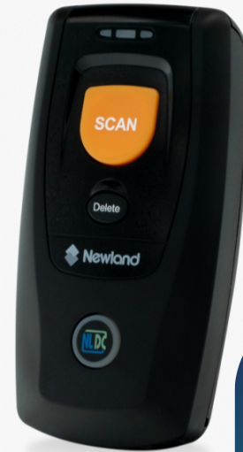
BS80 Piranha II 1D Handheld Scanners